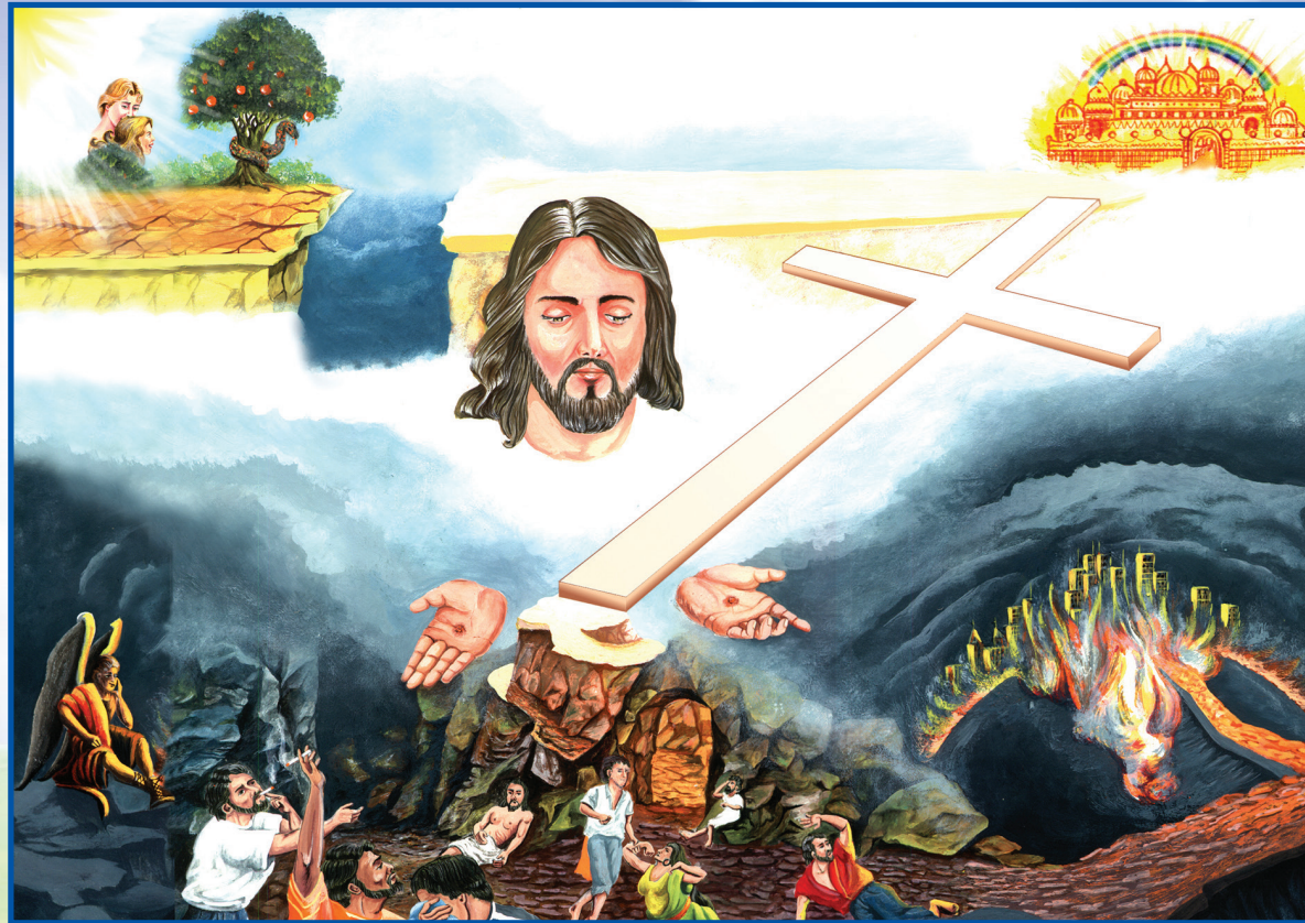
Man chose a wrong path that led to suffering. Christ is the bridge to eternal life.

When our case is examined in the heavenly court, Jesus presents Himself as our advocate and shows the Father and Judge the scars left by the nails that wounded Him on the cross (Zechariah 13:6) and says, “Father, I have